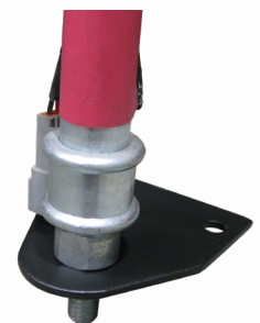
Safety flag mount