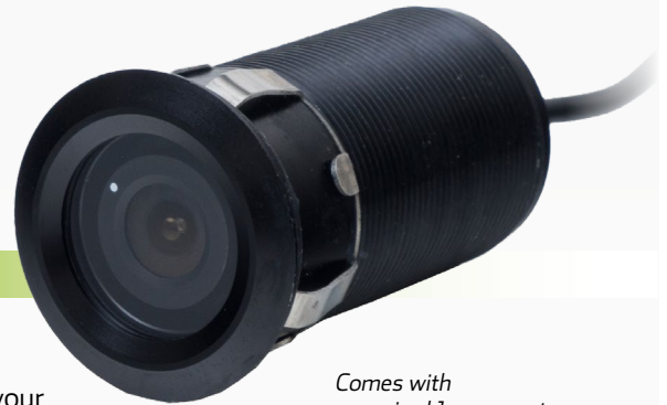
Comes with pre-wired 1m connector