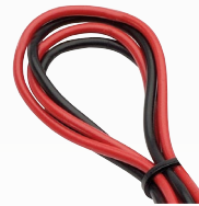
Comes with pre-wired twin core cable