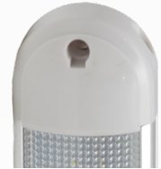
Easy to mount