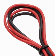
Comes with pre-wired twin core cable