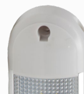
Easy to mount