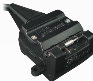
Pre-wired with a Narva 12 pin flat trailer socket