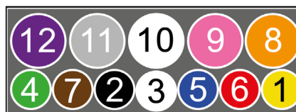
Plug cable entry view. Based on standard 12 pin wiring system