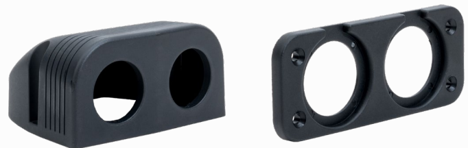
Both surface and flush mounting panels available