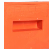
Molded carrying handle