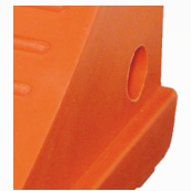
Mounting hole for rope, chains, brackets