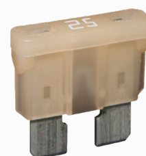
Standard (ATO) Fuse