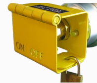
Securely locked in the OFF position