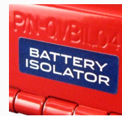
Powder coated for easy identification