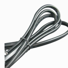
Heavy duty 16AWG cable