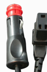
3 Pin DC power output